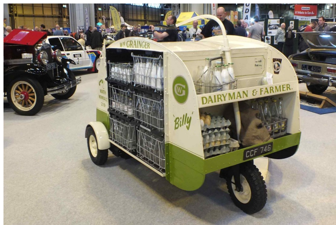
Clearly a Reliant influence here somewhere?