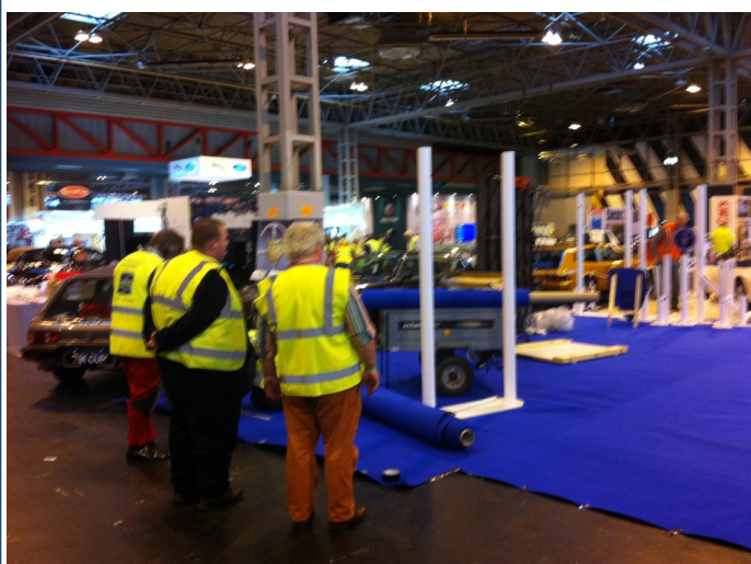
So where does this bit go?