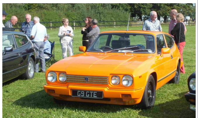
MB27 at Gatcombe