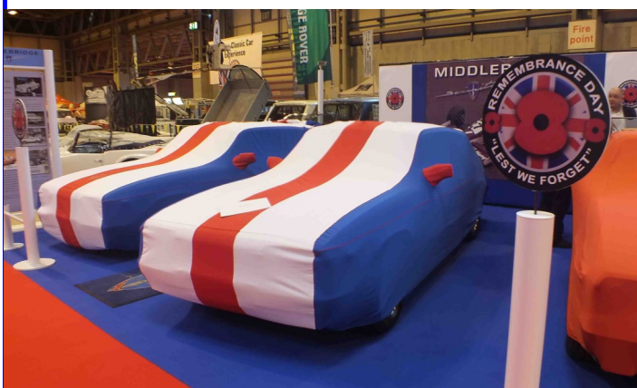
The Cars as Covered During the Two Minute Silences