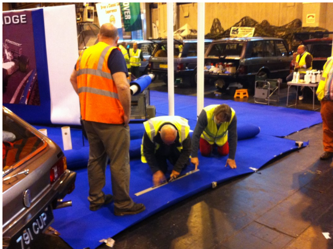
Never irritate a man with a steel rule and Stanley knife!